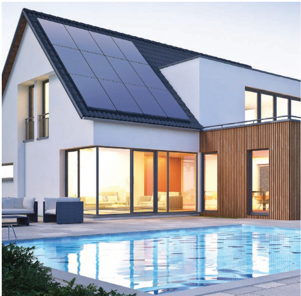
Semper Solaris is a licensed solar and roofing contractor who provides top quality roof replacement and solar installations throughout California.