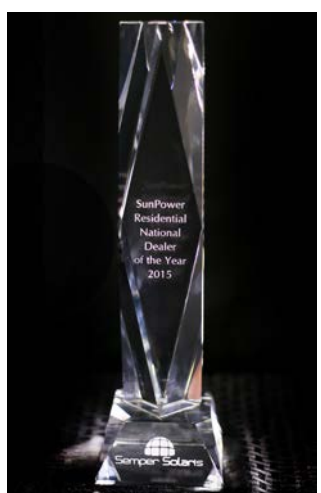
Semper Solaris wins SunPower's National Residential Dealer of the Year

The NABCEP is an excellent indicator of solar expertise. It is because of values and strengths like these that Semper Solaris is having such successful growth.